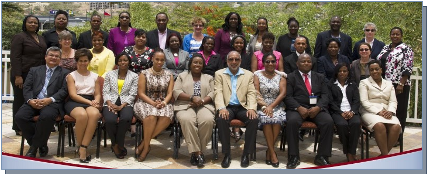
LDP Participants in Cohort 6 with members of CLP's Extended Delivery Team during the first face to face module that was held in St. Kitts & Nevis in June 2016. The next face to face module will be held in Grenada from July 18 - 22, 2016.

The April - June 2016 quarter was definitely one of the busiest and most productive for the CLP. The Sixth Cohort of our Leadership Development Programme (LDP) was launched and the first module was completed in St. Kitts and Nevis on June 3, 2016. This cohort comprises twenty-three Deputy Permanent Secretaries and officers of comparable rank from ten of the twelve participating countries in the CLP. In addition, during this quarter, Cohort 5 Game Changers continued to be engaged in the virtual component of our LDP through the delivery of two stimulating webinars on Obesity and Public Sector Transformation, respectively.